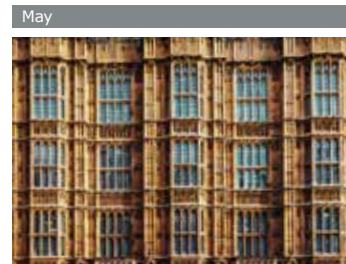
LONDON | UNITED KINGDOM