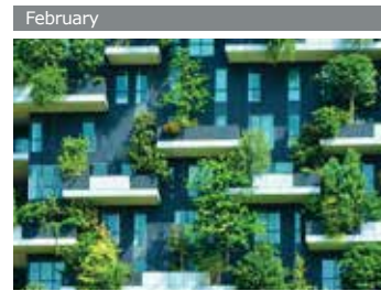
MILAN | ITALY