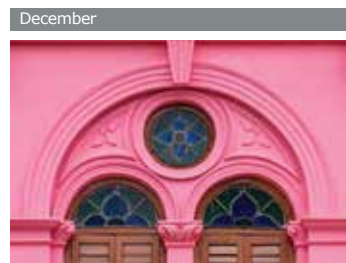
DHAKA | BANGLADESH