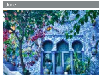
RABAT | MOROCCO