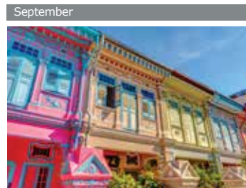
SINGAPORE | SINGAPORE