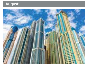
DUBAI | UNITED ARAB EMIRATES