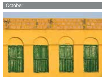
MOGADISHU | SOMALIA