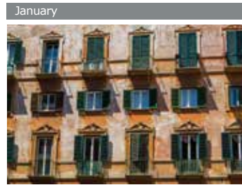
ROME | ITALY