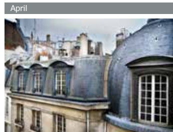
PARIS | FRANCE