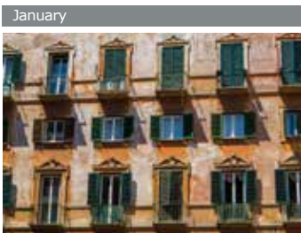
ROME | ITALY

Traditional banking products and distinctive tailor-made solutions, as well as linking our customers with premium foreign banks in countries we cover