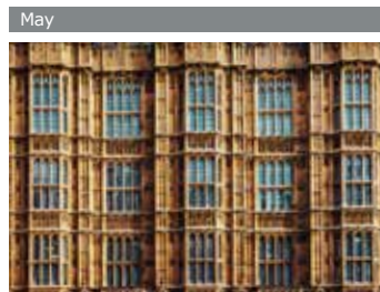
LONDON | UNITED KINGDOM