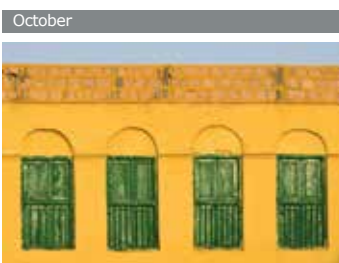
MOGADISHU | SOMALIA