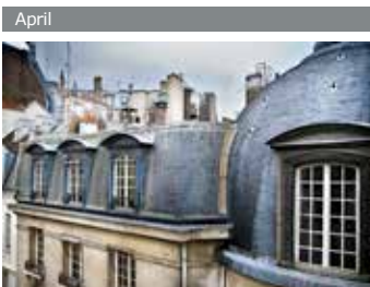
PARIS | FRANCE