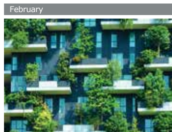
MILAN | ITALY