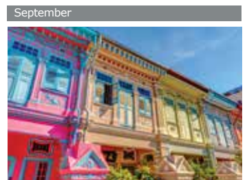
SINGAPORE | SINGAPORE