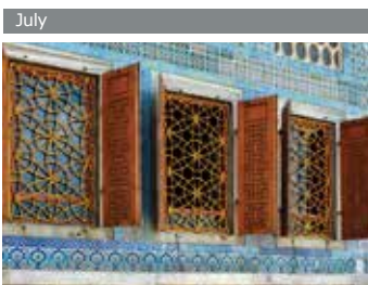
ISTANBUL | TURKEY