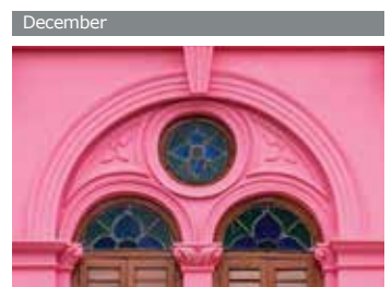
DHAKA | BANGLADESH